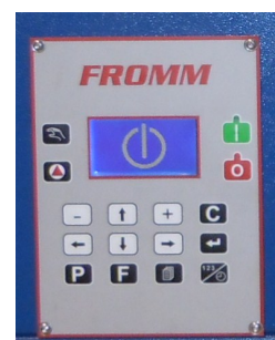
Easy to operate control panel